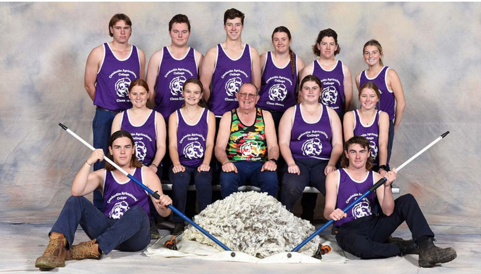
2023 SHEARING TEAM