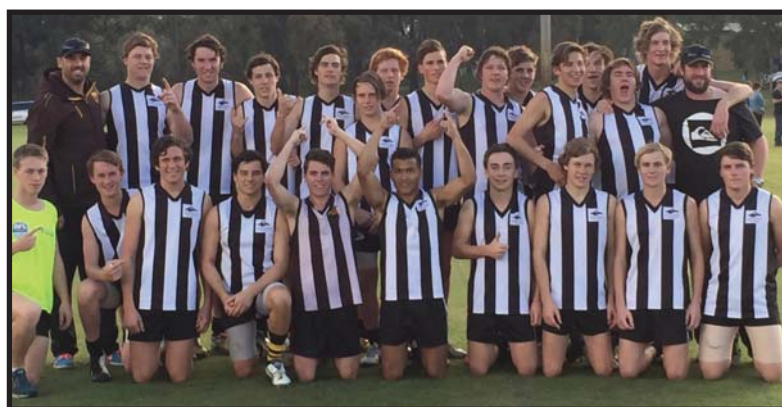
Football - 6th