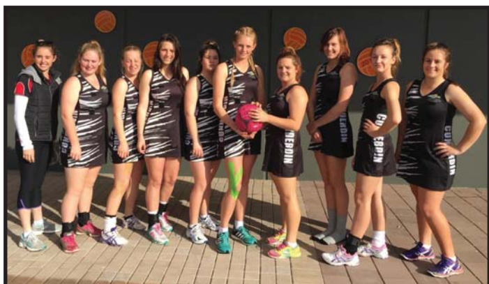
Netball - 2nd (on percentage)