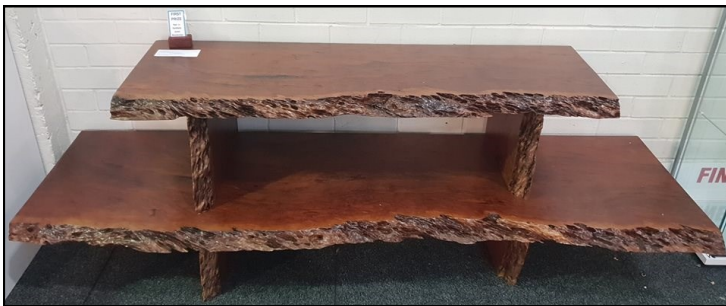
Kade Smith's TV unit (above)