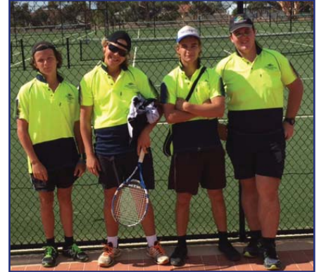
Boys Team 3