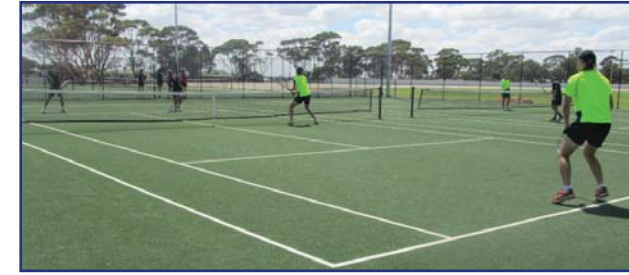
Boys Team 2